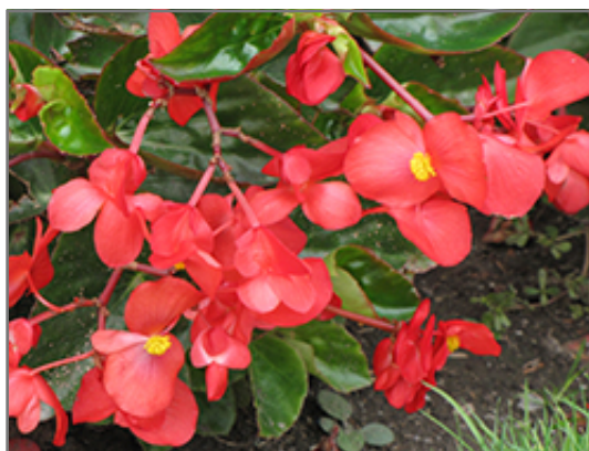
Dragon Wing Red Begonia flowers

Dragon Wing Red Begonia is an herbaceous annual with a trailing habit of growth, eventually spilling over the edges of hanging baskets and containers. Its medium texture blends into the garden, but can always be balanced by a couple of finer or coarser plants for an effective composition.