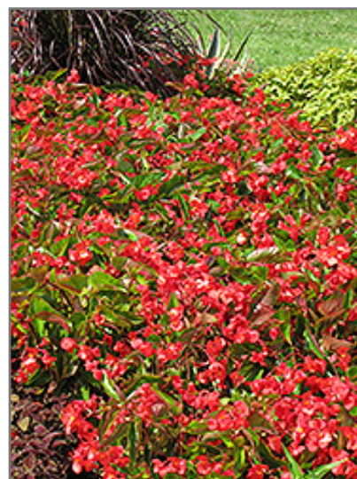
Dragon Wing Red Begonia in bloom