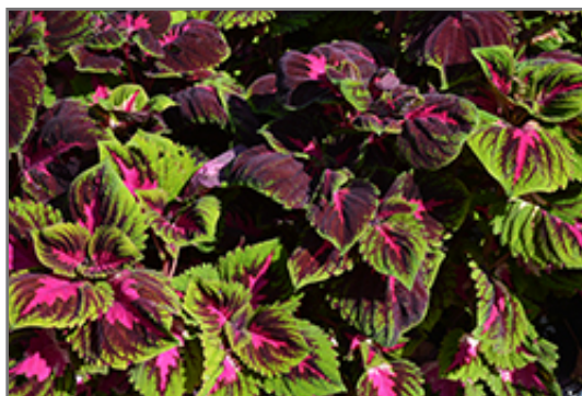
Kong Red Coleus foliage