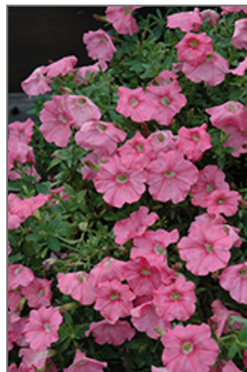
Supertunia Bermuda Beach Petunia flowers