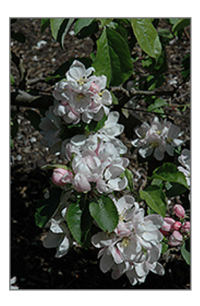
Golden Russet Apple flowers