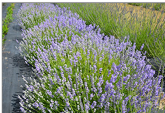
Blue Cushion Lavender in bloom