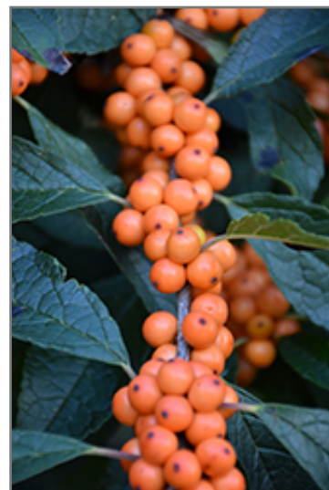
Winter Gold Winterberry fruit

Winter Gold Winterberry is recommended for the following landscape applications;