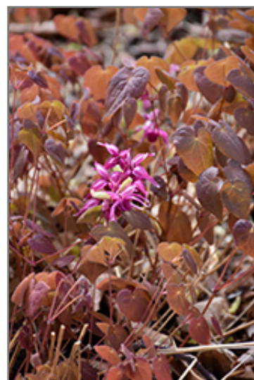
Yubae Bishop's Hat flowers