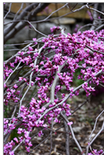
Ruby Falls Redbud flowers