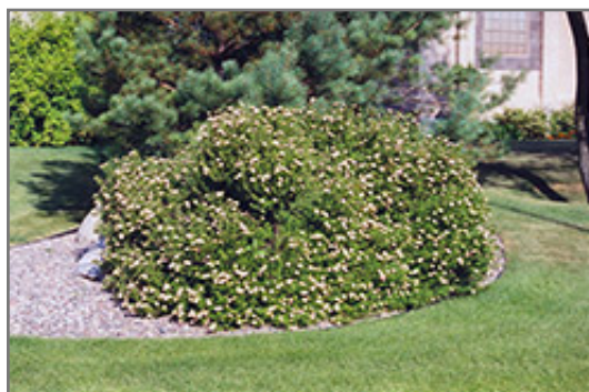
Pink Beauty Potentilla in bloom