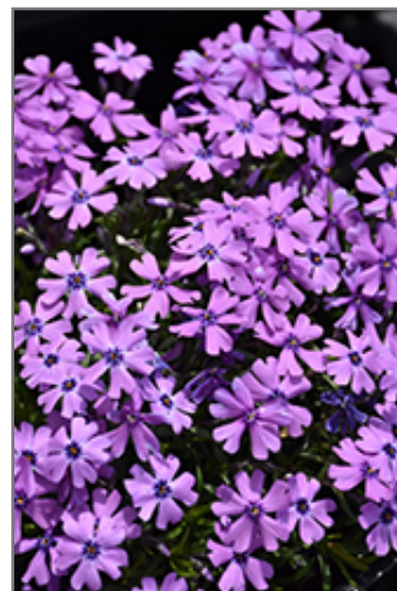
Purple Beauty Moss Phlox flowers