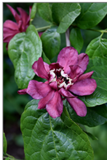
Hartlage Wine Sweetshrub flowers