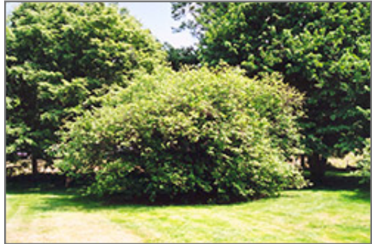
American Hazelnut

This plant is typically grown in a designated edibles garden. It performs well in both full sun and full shade. It is very adaptable to both dry and moist locations, and should do just fine under average home landscape conditions. It is considered to be drought-tolerant, and thus makes an ideal choice for xeriscaping or the moisture-conserving landscape. It is not particular as to soil type or pH. It is highly tolerant of urban pollution and will even thrive in inner city environments. This species is native to parts of North America.