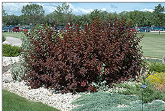
Diablo Ninebark