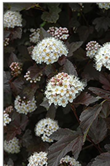
Diablo Ninebark flowers

Diablo Ninebark is recommended for the following landscape applications;