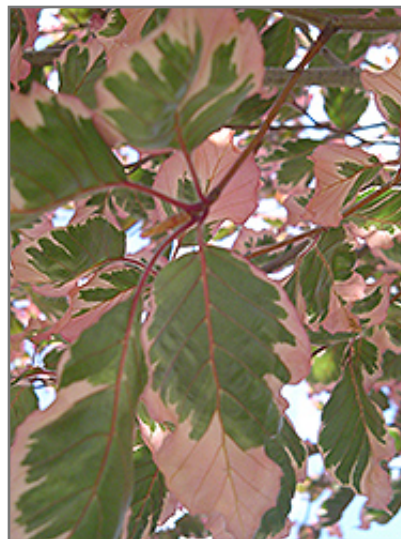
Tricolor Beech foliage