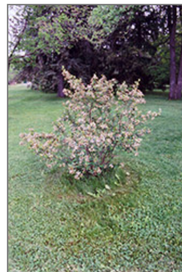
Black Chokeberry in bloom