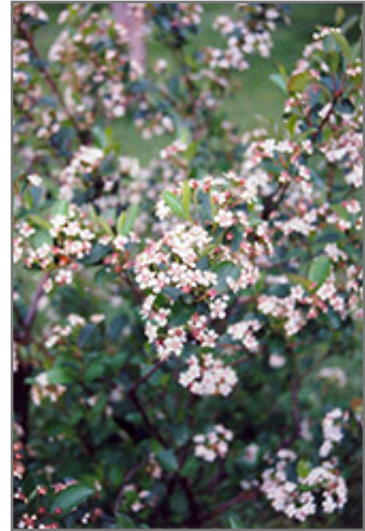
Black Chokeberry flowers

This shrub should only be grown in full sunlight. It is an amazingly adaptable plant, tolerating both dry conditions and even some standing water. It is not particular as to soil type or pH, and is able to handle environmental salt. It is somewhat tolerant of urban pollution. This species is native to parts of North America.