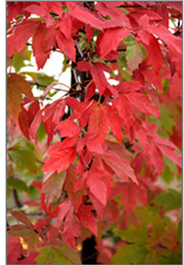
Paperbark Maple in fall

This tree does best in full sun to partial shade. It prefers to grow in average to moist conditions, and shouldn't be allowed to dry out. It is not particular as to soil type or pH. It is somewhat tolerant of urban pollution. This species is not originally from North America.