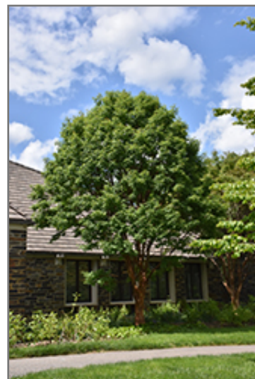
Paperbark Maple